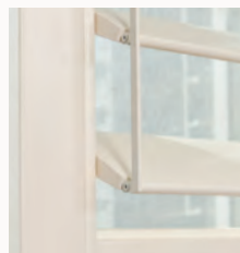
TruView® Hidden Tilt Mechanism o