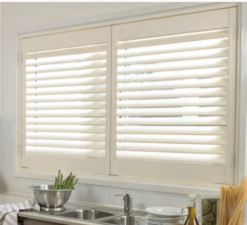
Standard Hinged Model