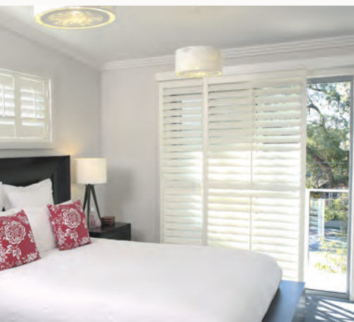
Sliding on Track Model