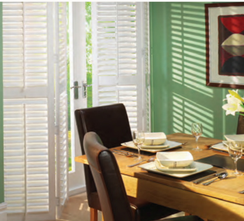
Bi-Fold Model (also available on track)