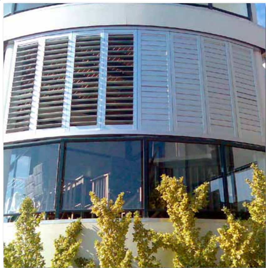
Open or closed blades - at your control.

Using only the highest quality of finishes which is backed by a 7 year warranty, Bermuda® 2000 Series will create maintenance free durability and style to your home, office, or commercial environment.